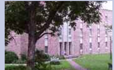
Cockroft Residence Hall

Cockroft Renovations. Increasing the number of men on campus has stimulated the partial renovation of Cockroft Residence Hall for male students. With the commitment of volunteer service and the purchase of supplies, a number of churches made it possible to renovate a substantial part of the residence hall.