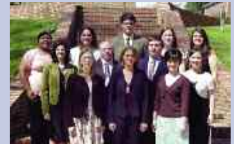
2006-07 Student Government Association Council

Student Government. As reported earlier in the College's electronic newsletter, The Mountain Express, three male representatives were elected to serve on the 2006-2007 Student Government Association Council. The Council is currently reviewing the constitution and will recommend revisions that will be voted on by the entire student body.