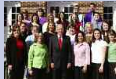
William Winter Scholarship Recipients

Leadership Opportunities. The College is becoming more intentional about providing leadership opportunities for all students as a part of the College's tradition. This year's chapel theme is "Servant Leadership: Lighting the Path." The program of chapel talks has renewed an interest in providing leadership opportunities that focus attention toward the kind of leaders the College desires to nurture.