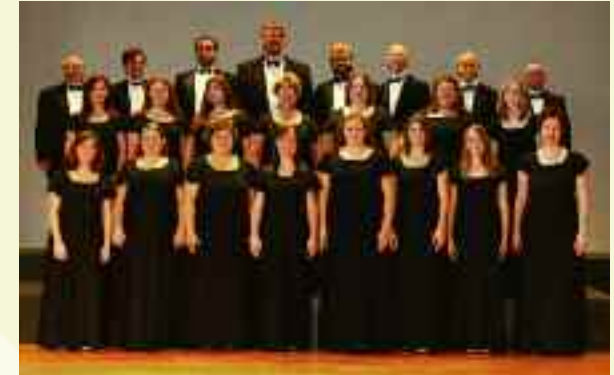
2006-2007 BMC Chorale