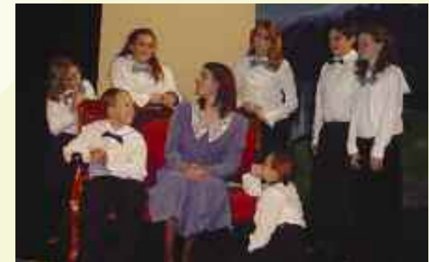
2006 Production of The Sound of Music