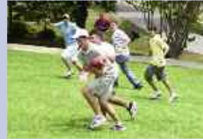
Men's Intramural Sports